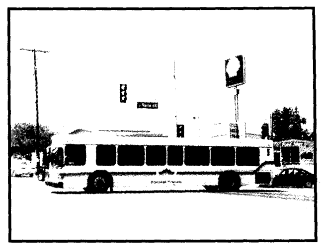
Foothill Transit at Puente Hills Mall (left) and along Route 66 in Glendora.