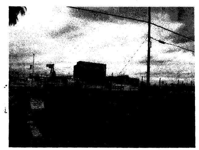
Van Nuys BI, looking northeast