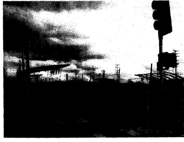
At Van Nuys BI, looking east