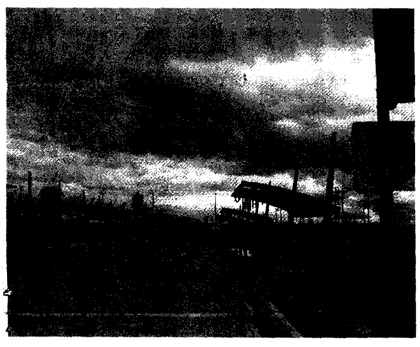
<sup>5</sup> At Van Nuys Bl, looking east