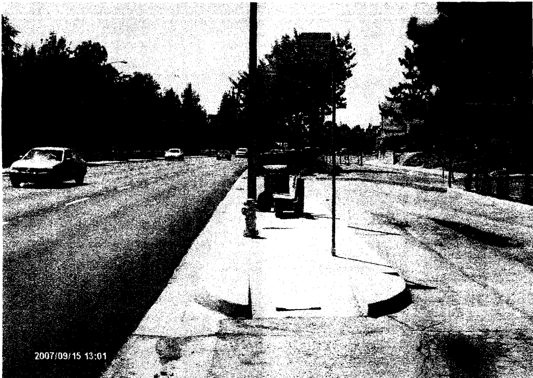
One of two turnouts on the LEFT side of eastbound Huntington Drive in Arcadia. These minimize dangerous mid-block crossings for Santa Anita racetrack and Methodist Hospital