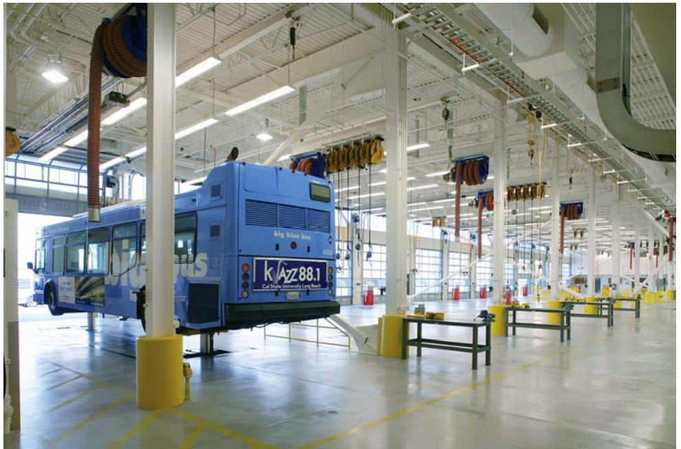
Big Blue Bus NABI 4028 is on a lift inside the new facility.