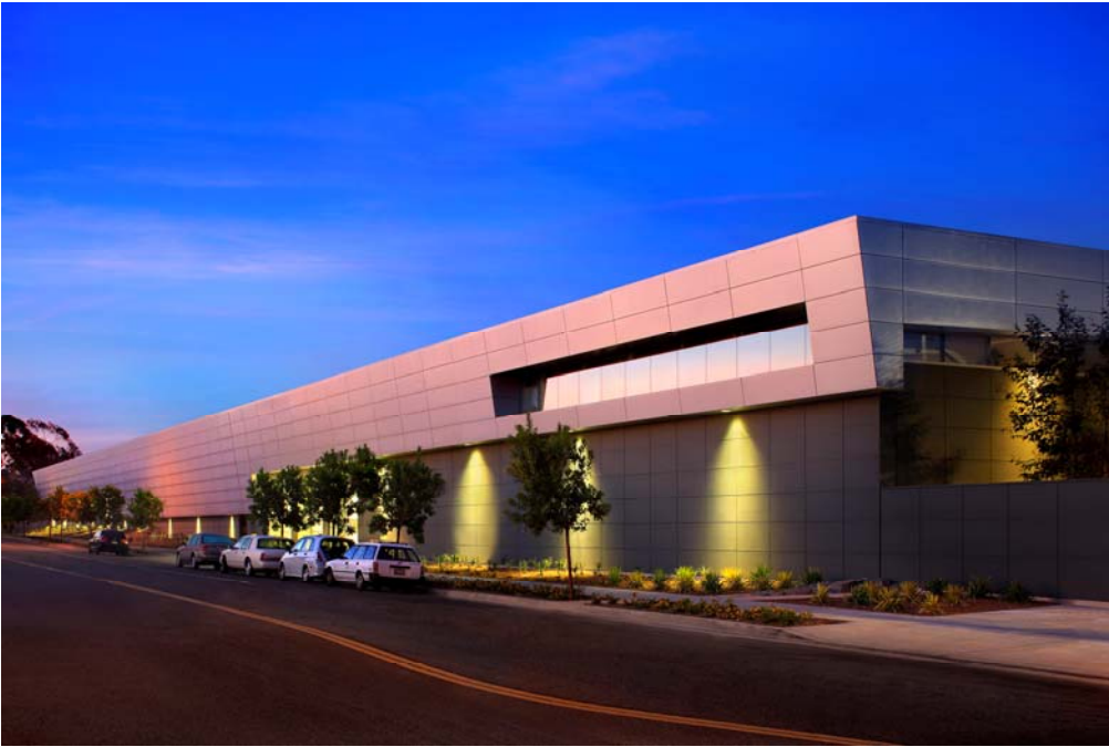
The exterior of the new Big Blue Bus maintenance facility.