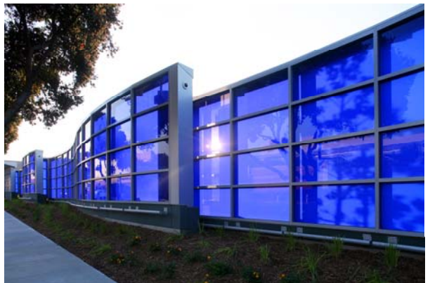
Above is a photo of the 200-foot Art wall

Thanks to the City of Santa Monica for providing the information and photos for this story. 🚌 🚌