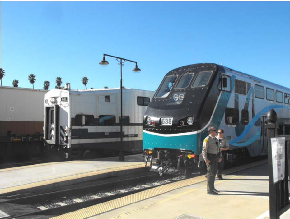
Metrolink Cab Car 638 at the Glendale Station during a public demonstration run on December 6, 2010.