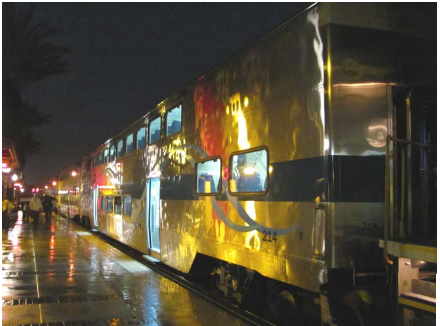
Metrolink Coach 214 in service on Metrolink Train 700 at Fullerton on December 20, 2010. The car is operating with three Bombardier Cars.