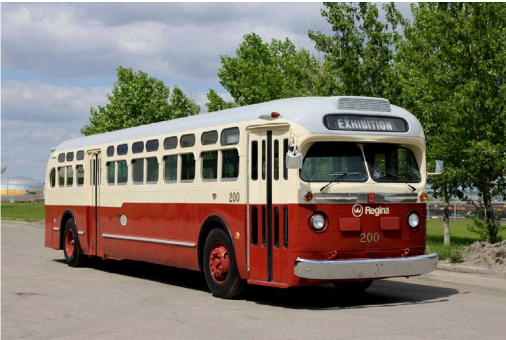
Regina Transit historic bus 200 in Regina Saskatchewan Canada.

Bus 200 is a 1954 built GMC TDH-4801 and was delivered to Los Angeles Transit Lines as 6583. The photo was taken in June 2011.