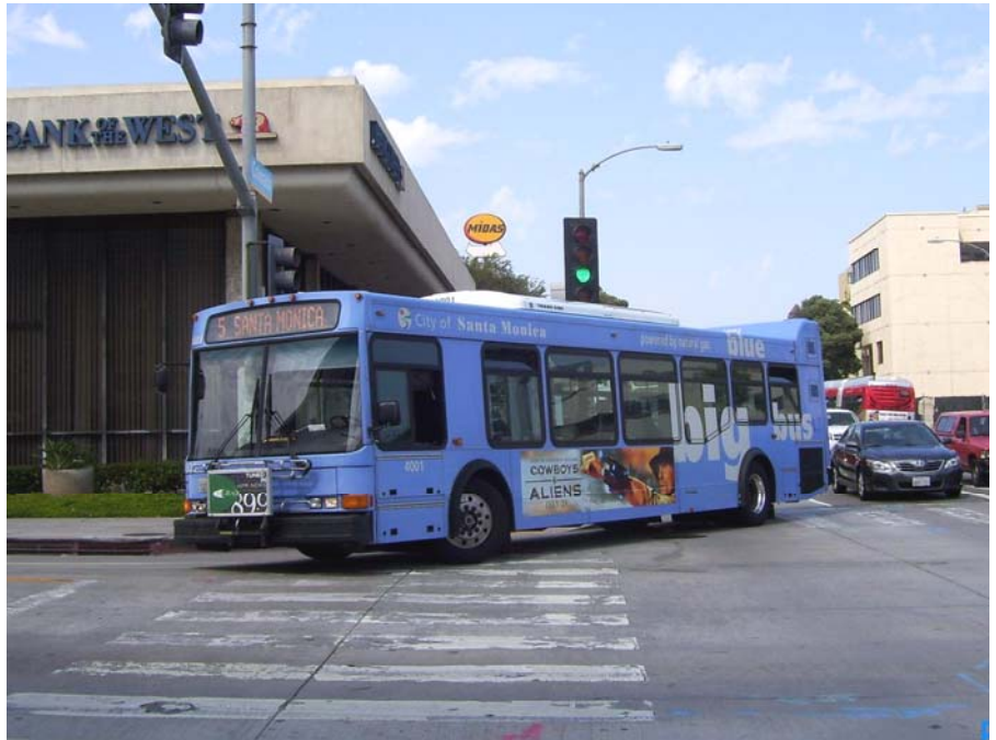
Santa Monica Big Blue Bus NABI 4001 in downtown Santa Monica on June 28, 2011.