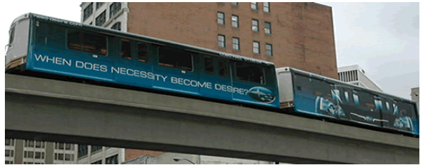
(Detroit People Mover photo)

No Bus - Bus Stop: This bus stop sign is in Old Town Sacramento and was once used by Regional Transit Bus Line 143. Photo by Andrew Novak. 🚌 🚌