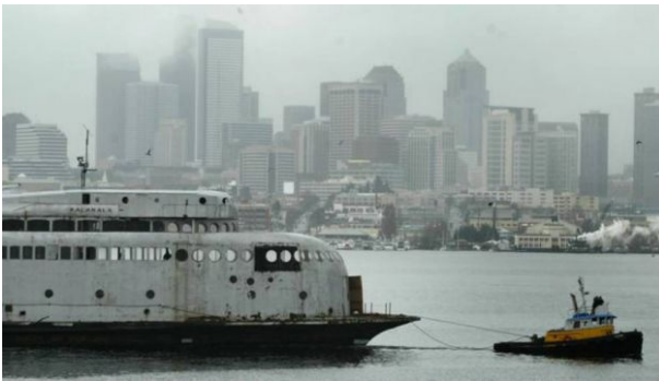
The Kalakala in Seattle in 2004.

Ferry Boat Kalakala: In December 2011 the former Washington State Ferry Kalakala was sold to an anonymous buyer for $1 with plans to restore the streamlined ferry. The Kalakala began life as Key System Ferry Peralta and operated between Oakland and San Francisco. In 1933 an arson fire destroyed the Peralta and the hull was sold to the Puget Sound Navigation Company where she was rebuilt as a streamlined vessel Kalakala . She continued to operate in the Puget Sound until retired by the Washington State Ferry system in 1967. The ship then traveled to Alaska where she became a crab processing vessel. From 1967 to 1982 the Kalakala worked in Alaska as a crab processing vessel and was then abandoned in Alaska. Since 1982 various efforts to save the ship have failed and this is probably the ship's last chance. To follow the history of this classic vessel visit: www.kalakala.org