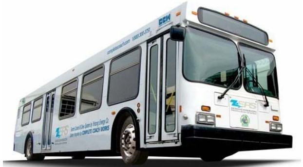
(Complete Coach Works ZEPS Bus)

bus (a former Long Beach Transit diesel low-floor) for attendees to board and explore.