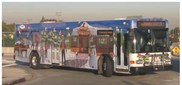
Above is the Norwalk Transit holiday bus in 2007.

Photos of holiday decorated buses and trains for the January issue of the newsletter. Please email submissions to the newsletter editor at: rtd1121@yahoo.com