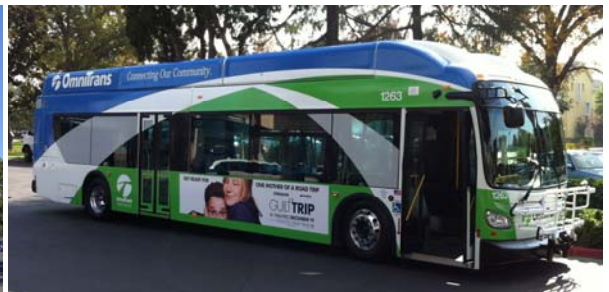
At left is an Omnitrans bus at one of the new bus stop shelters. Above is New Flyer 1263 at the dedication on December 4 th .