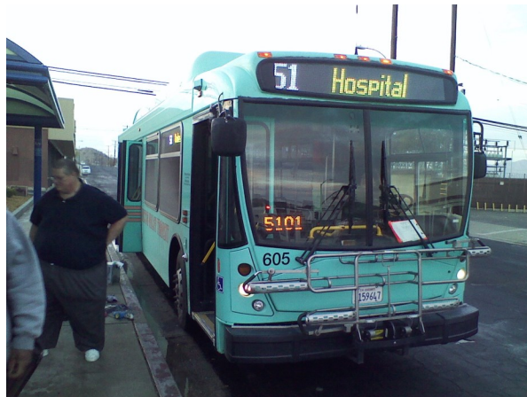
NABI 605 at B and 7th