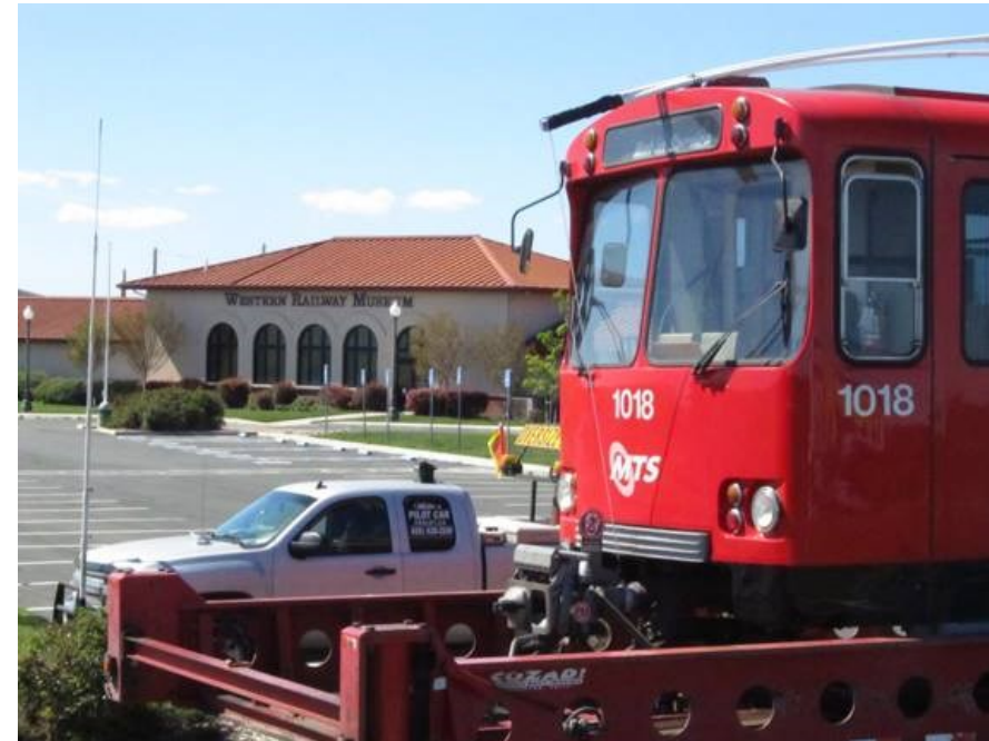
Recently former San Diego MTS LRV 1018 was donated to the Bay Area Electric Railroad Association and has joined their collection at the Western Railway Museum in Rio Vista Junction California. The 1018 is the second LRV to join the collection, SF Muni Boeing 1258 was the first.