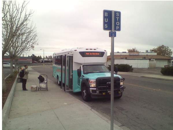
VVTA 2013 at 7th and Lorene on November 29, 2013.

Now we were going up the hill, through a landscape consisting of open spaces and sagebrush. We passed pipeline construction adjacent to the road and spotted hillsides green from the recent rain. Then we passed rough looking mountains and spotted the nearby train tracks of the BNSF (former Santa Fe) and Union Pacific (former Southern Pacific).