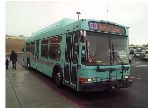
VVTA NABI 601 at the Mall of Victor Valley on November 29, 2013

visiting Grimaldi Circus followed by clusters of retail. Two boarded at Catalpa and I Ave.