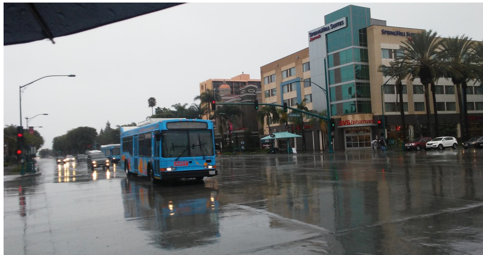
Disneyland-bound Anaheim Resort Transit # 2160 (ex-OCTA) getting rained on 1/12/16