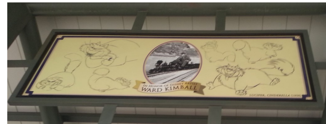
Panel honoring artist Ward Kimball, at Perris Transit Center